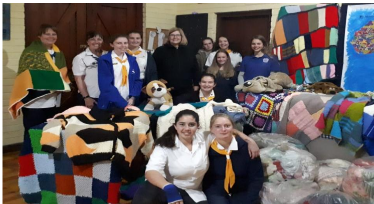
Knitted blankets for the needy.