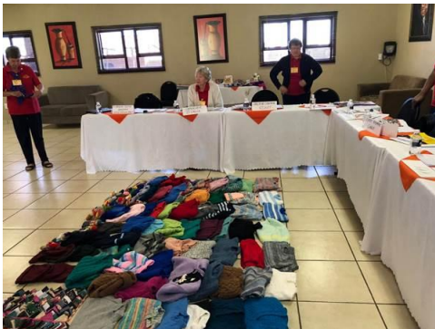
Trefoil Guild winter warmers.