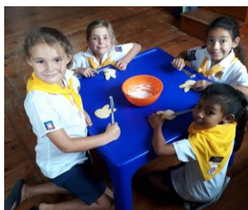
Bergvliet Teddies making yummy Easter biscuits! They baked and iced their biscuits! Well done girls!! Sure they were absolutely delicious!

Take the Lead Adventure:- Invite a Guiding leader to tea. Discuss her role in Guiding.