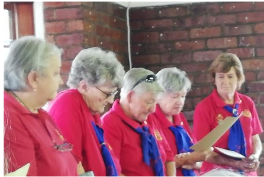
Thinking Day Ceremony by one of the Guilds.