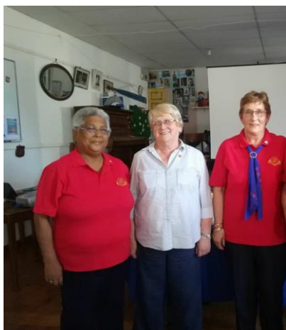
Regional Trefoil Guild A.G.M.