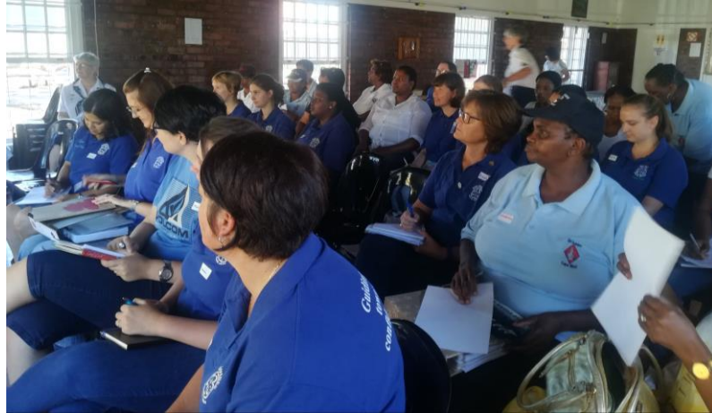
ALQ TRAINING held March 2018▶

We had a great turn out at the Adult Leader Qualification Training (ALQ Theory) this term. The practical training will be held on 21 April 2018 . Closing date for applications is 10 April . All these ladies in the photo are expected to be there as well as those hidden from the camera!!