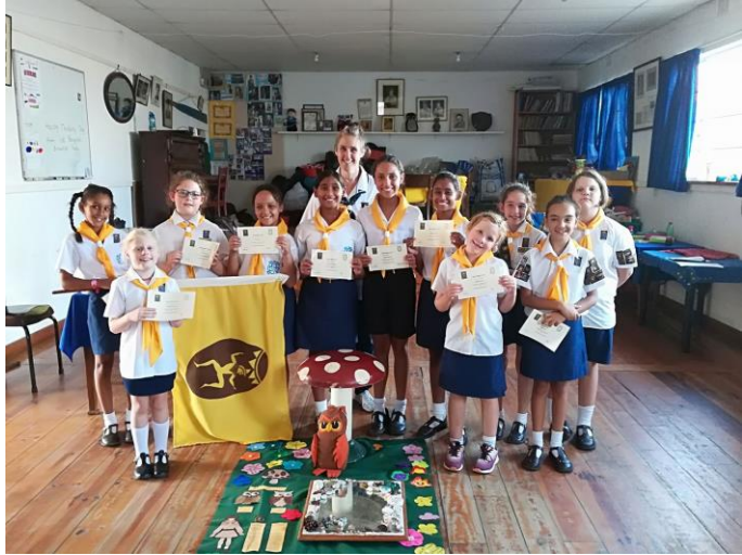
2nd Bergvliet Brownies celebrated four enrolments